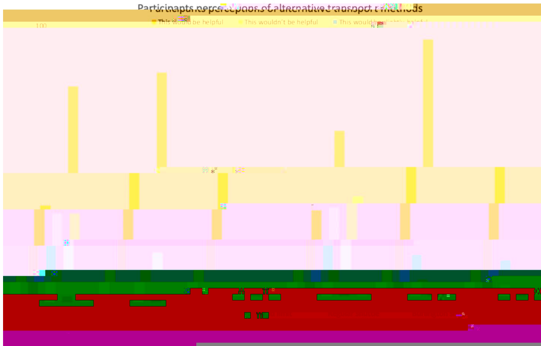
Ranking of suggested alternatives

Car ownership was a major topic that we wanted to include in our research. Before conducting our research, we had certain expectations about the high rates of car ownership within the village. These expectations were correct, as the results showed that 1% of the participants do not own a car, while 47% owns two cars and 52% owns one car. These findings are significantly different to the data from the Arvida survey, which found that only 25% of residents owned at least one car (Dares et al., 2022). However, the survey stated that the average for this age group is 98%, so our results closely resembled this number. Figure 7 below indicates the rates of car ownership within the participants.